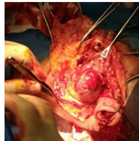
Figure 2: Intraoperative image showing a capsulated, solid and cystic mass in the superficial lobe of the left parotid gland.

Patient underwent a combined parotidectomy and thyroidectomy (Figure 2); a temporary tracheotomy was performed due to the preexisting conditions of the patient.